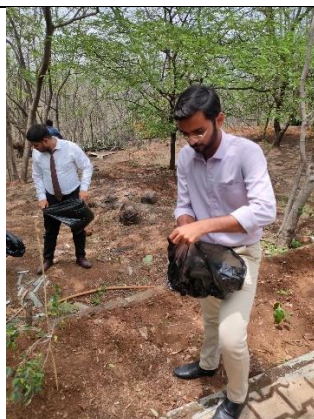
Swachh Bharat Abhiyan at Durga Tekdi