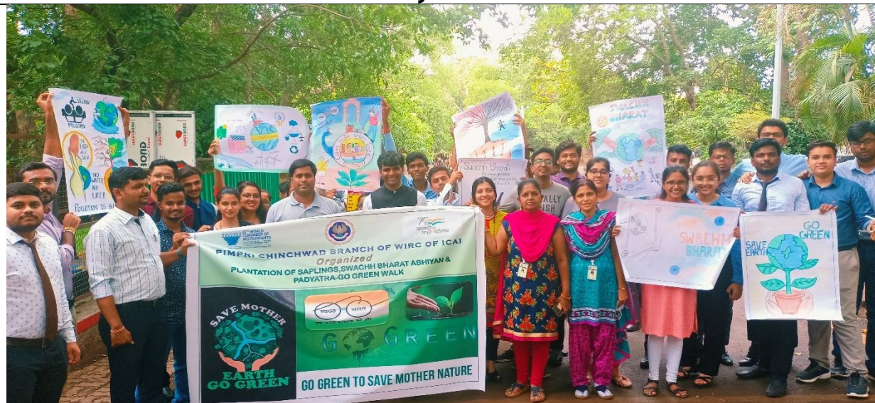
Swachh Bharat Abhiyan & Padyatra-Go Green Walk with Posters at Durga Tekdi