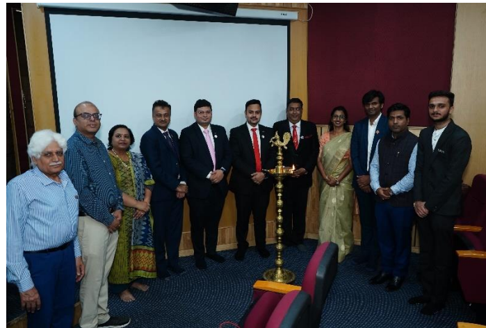
Lighting Lamp Ceremony at the hands of the WIRC Office Bears Team