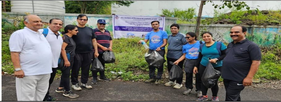
Cleanliness Drive at Malhar Fort on 2.10.2023