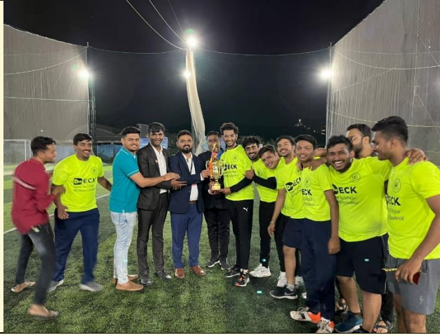
Felicitation of Winner- Box Cricket Team