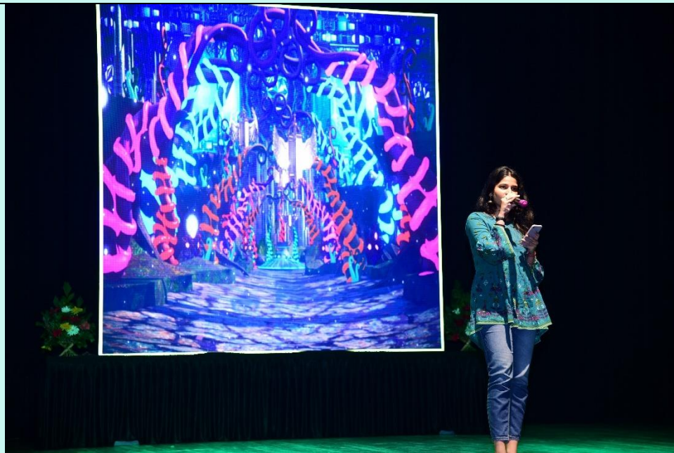
Singing Performance by CA Students