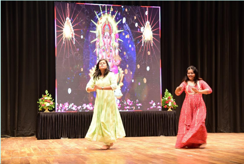
Dance Performance by CA Students